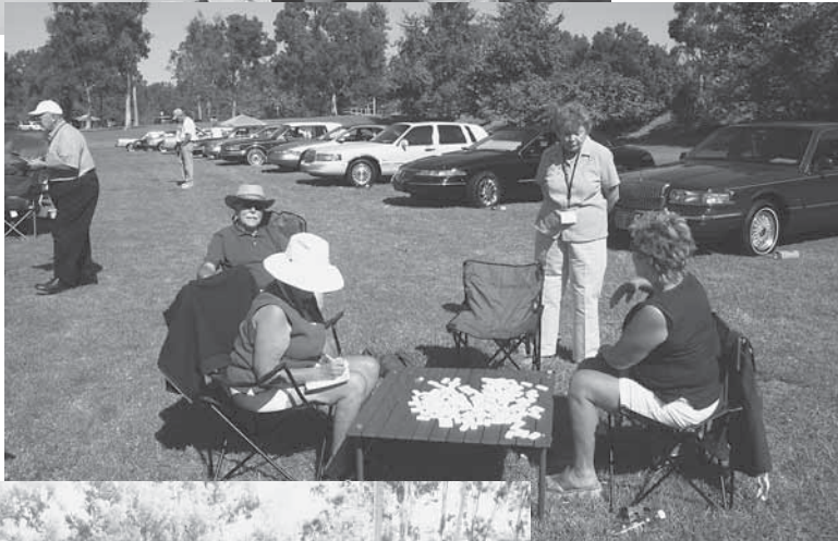
Time out for games.