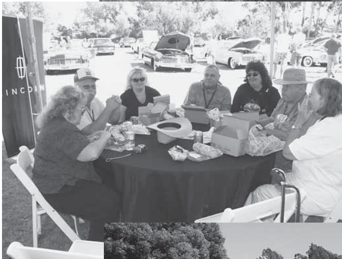
Lunch in the Lincoln-Mercury Division tent.