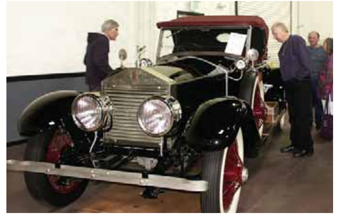
Above, 1923 Springfield Rolls-Royce Piccadilly Roadster. Below, 1937 Cord 812 Supercharged Phaeton.