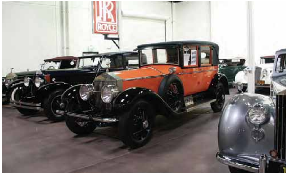
1926 Springfield Rolls-Royce Silver Ghost Tilberry Sedan.