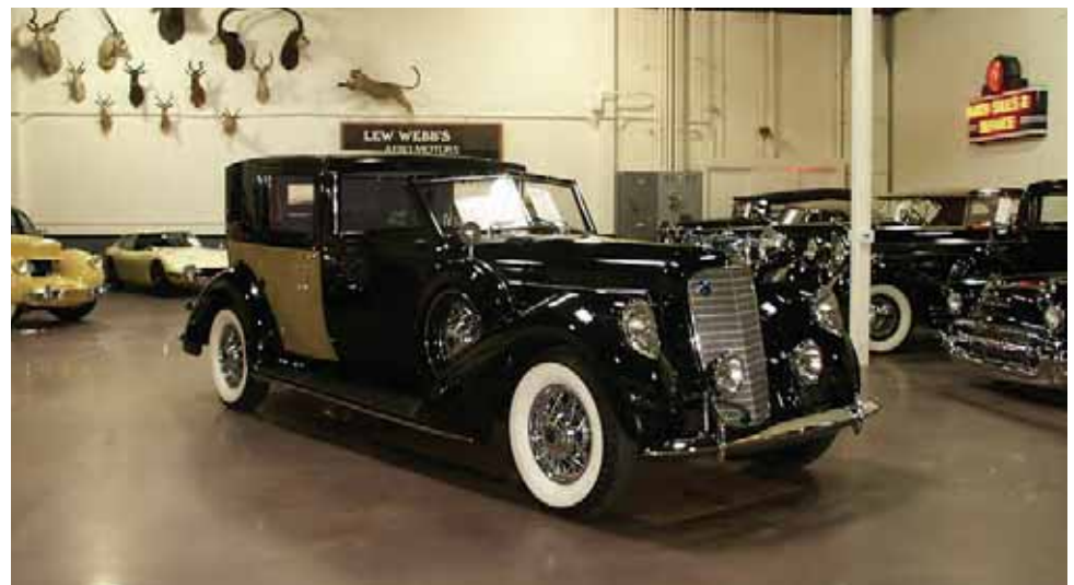
1937 Lincoln K Seven-Passenger Panel Brougham by Willoughby.