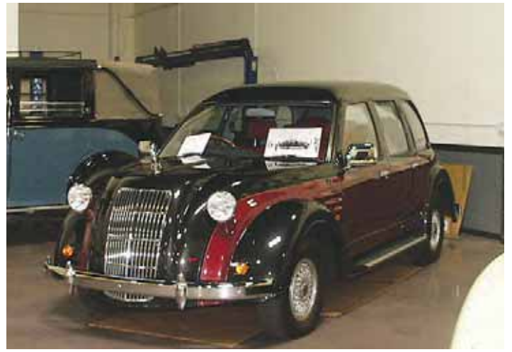
Replica of the first Toyota in 1936.