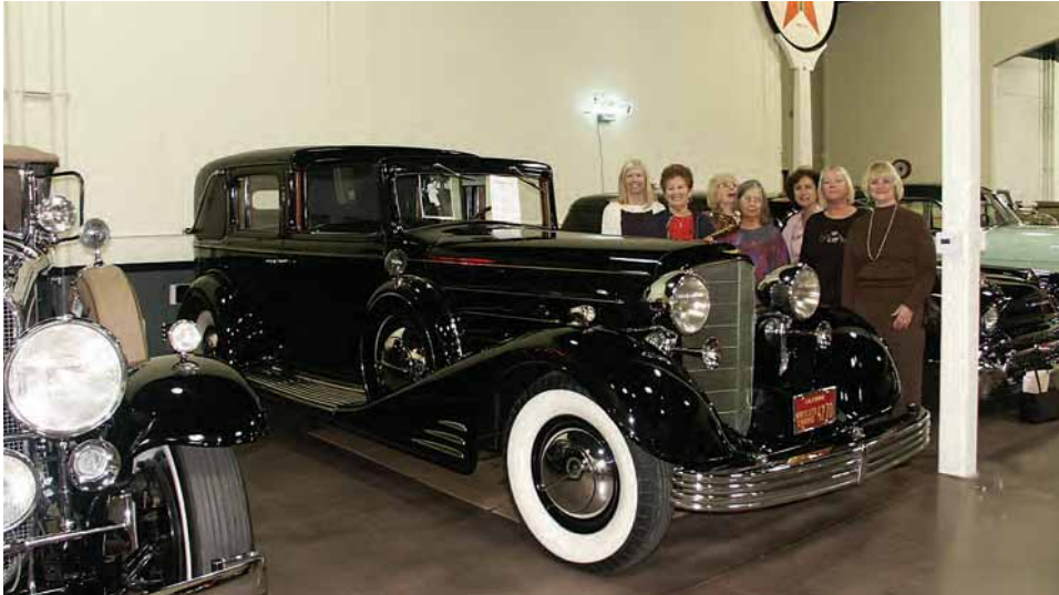
The Western Region Girls with Joan Crawford's 1933 Cadillac V-16 Town Car.