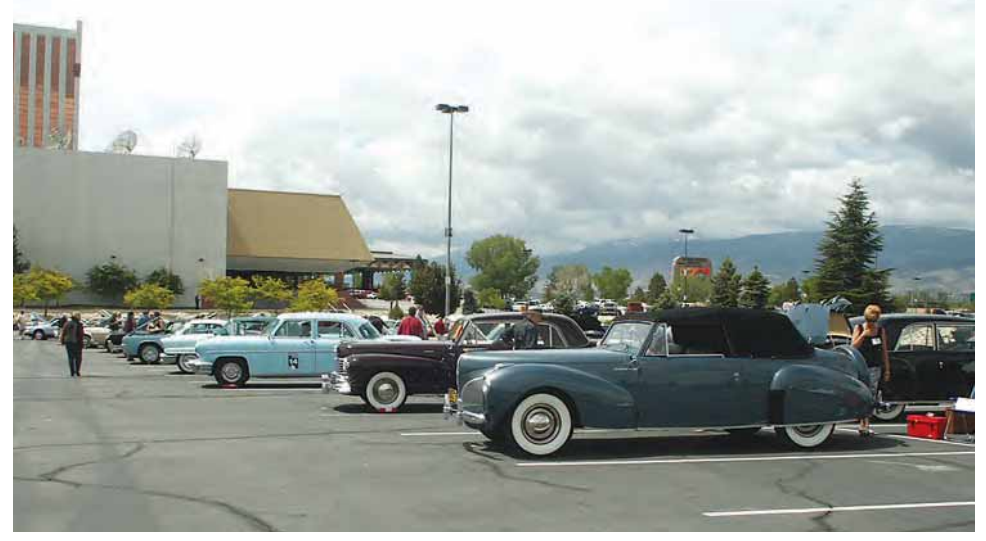
Above and lower below, the field at the Grand Sierra Hotel, Reno. Directly below, the cars in the mountains above Incline Village, Lake Tahoe.

Western Region Lincoln and Continental Owners Club Publication Volume 38 No 5, July, 2009