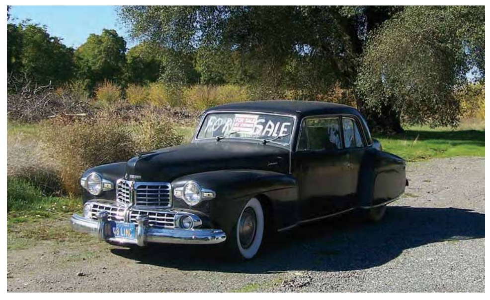
The car as is it was found in Gridley, California.