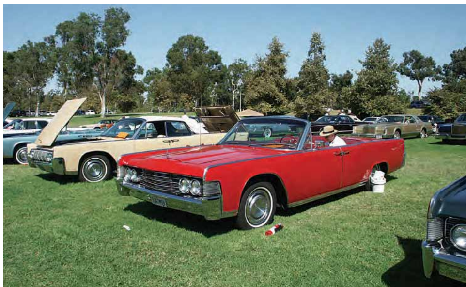
Carol Reniger's 1965 Lincoln Continental Convertible at Irvine in 2008.