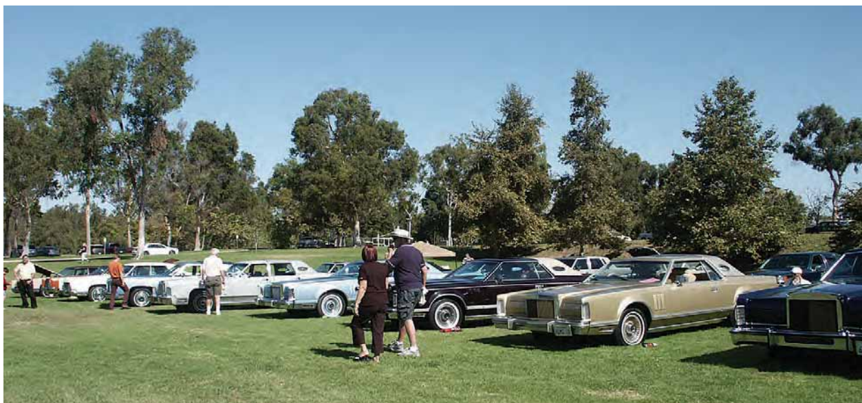
Lincolns at the 2008 Western National Meet in Irvine.