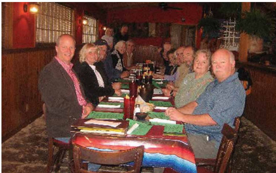
2010 Western National Meet Planning Committee at the January 16 first gathering.