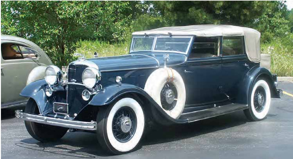
This 1932 Lincoln KB has been donated by Ford to the Lincoln Foundation.