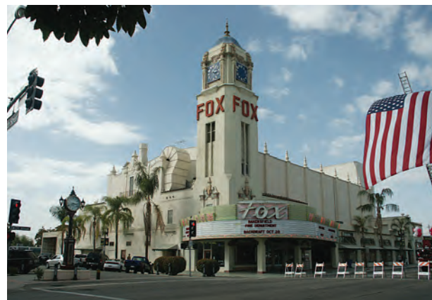
The Fox Theater, another Bakersfield landmark.

Left, the 1993 Mark VIII parked in front of our Bakersfield Board Meeting.