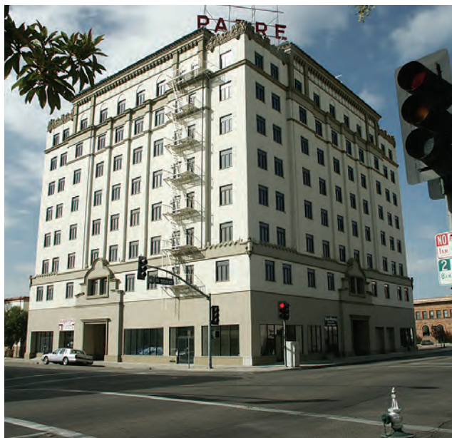
The Padre Hotel, a Bakersfield landmark.