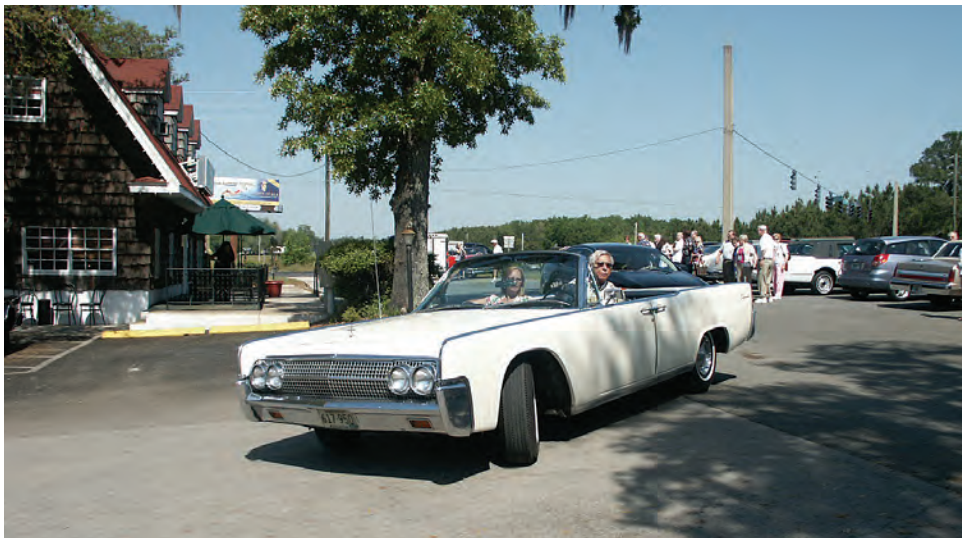
On the driving tour at the 2010 ENM, Ocala Florida.