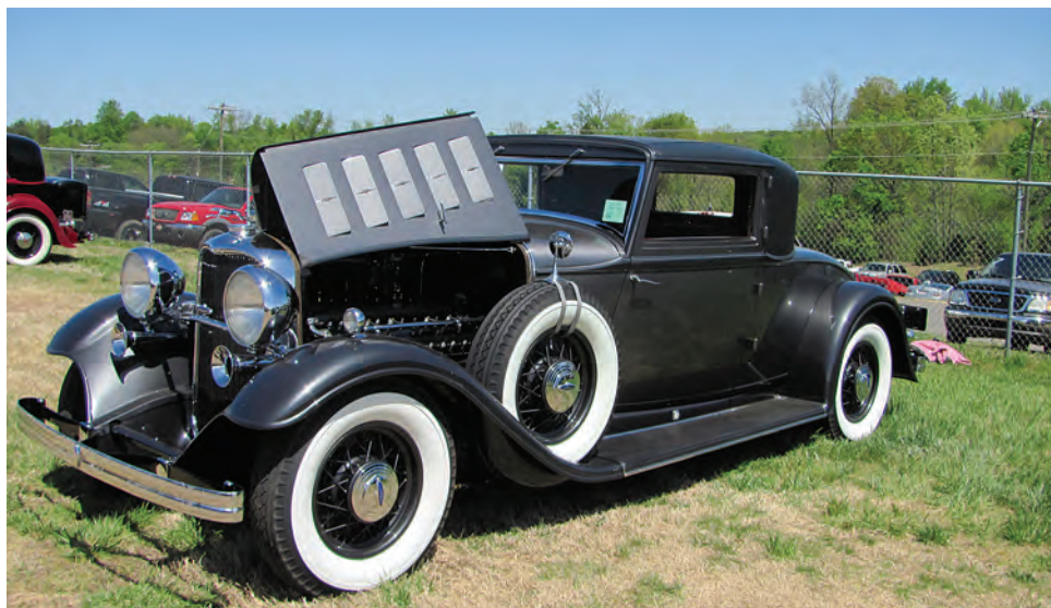
1932 Lincoln KB at the Lincoln Foundation Meeting and Charlotte Show.