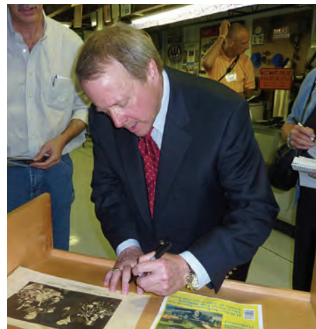
Edsel Ford II signing autographs at the Lincoln Foundation dinner.