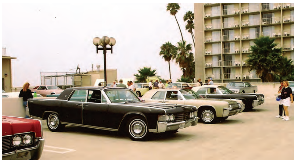
Some of the cars at the 2002 Ventura Western National Meet.