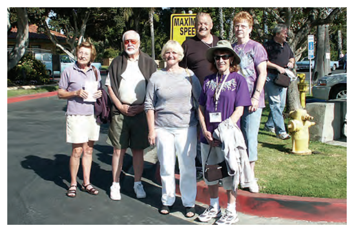
Ready for the Thursday morning tour.