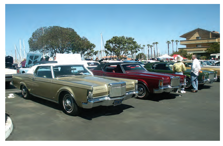
The three Mark IIIs.