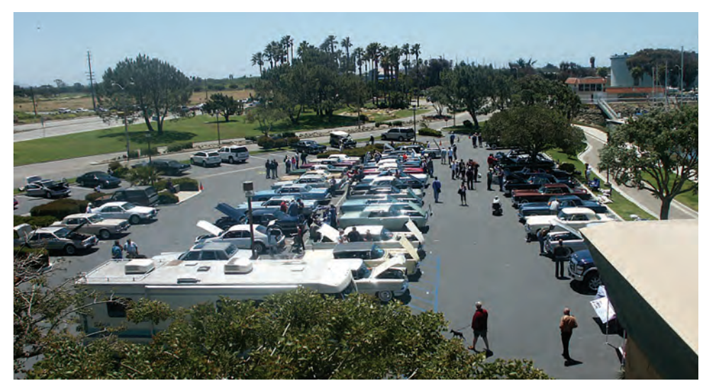
Overview of the field from the Holiday Inn Express balcony.

Western Region Lincoln and Continental Owners Club Publication Volume 39 No 4, June, 2010