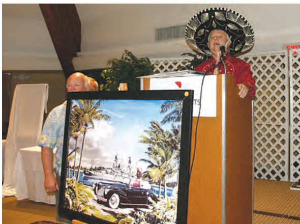
Left, auctioning off Den's painting of a 1941 Lincoln Continental at Pearl Harbor.