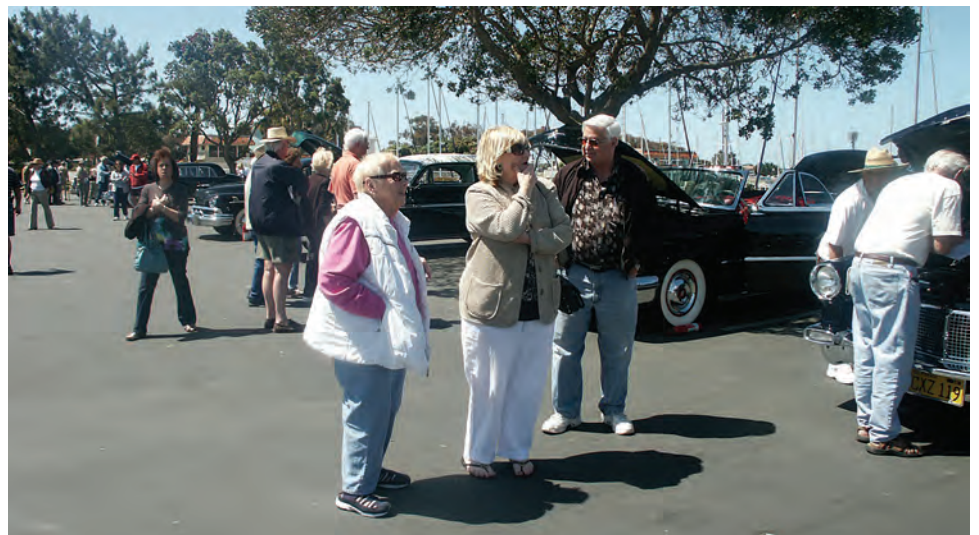
The field at the Holiday Inn Express mid day Saturday.