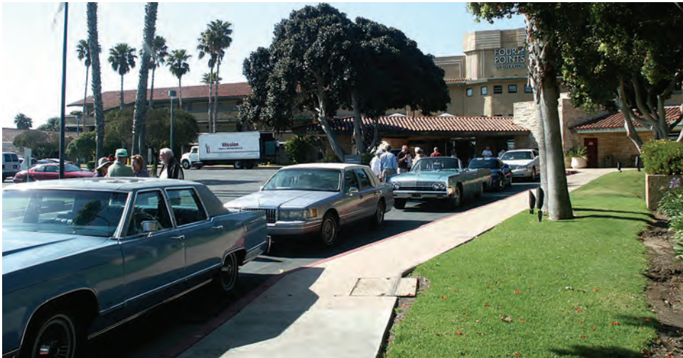
Getting Ready for the Thursday Morning Tour at the at the Four Points by Sheraton.