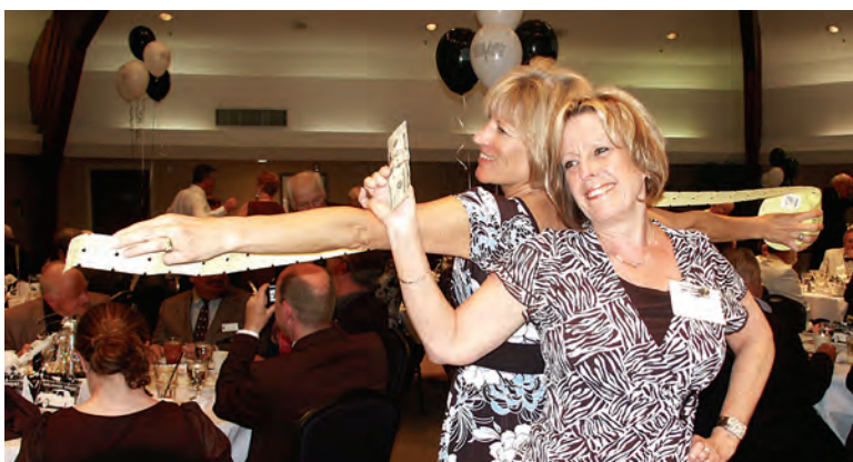
Left, raffle ticket entertainment.