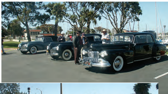
Above right, some of the Forties Cars.