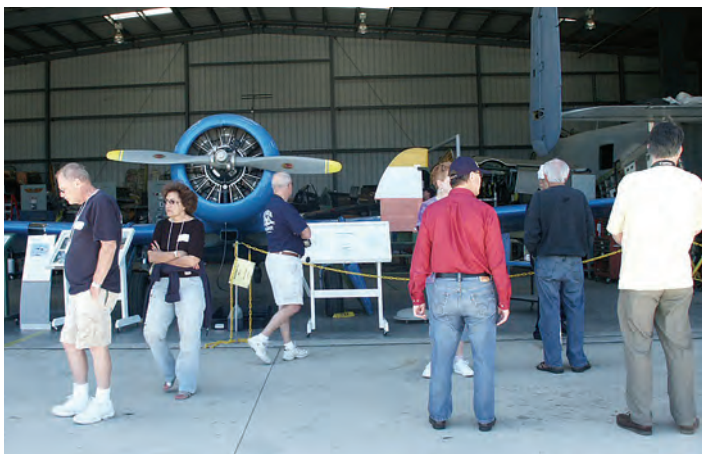
Thursday morning at the WW II Aviation Museum.