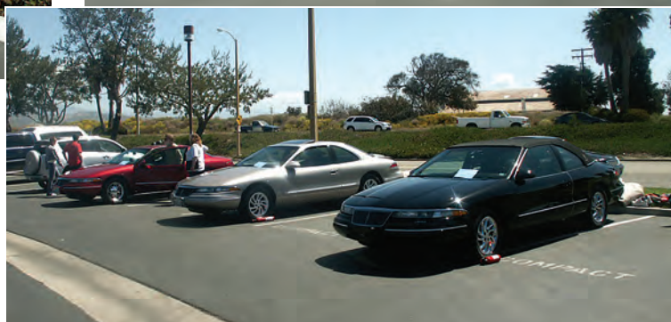
Right, the Mark VIIs.