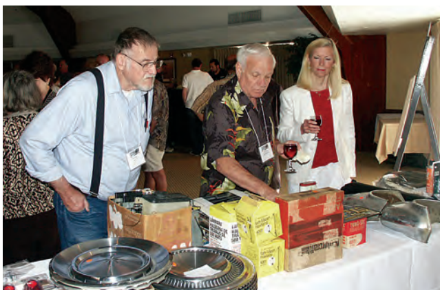
Left, inspecting the generous supply of auction items.