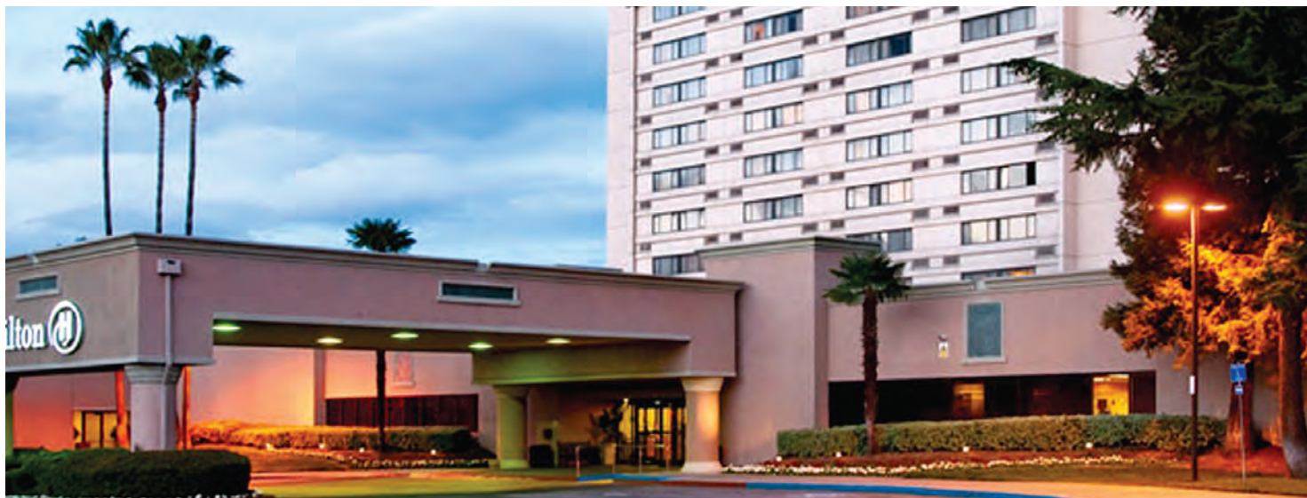
The Concord Hilton Inn will be the site of the 2012 Western National Meet.