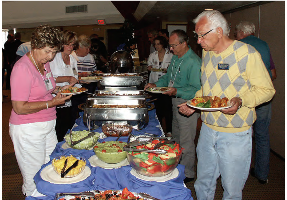
Members at the 2010 Western National Meet Friday night buffet/auction.