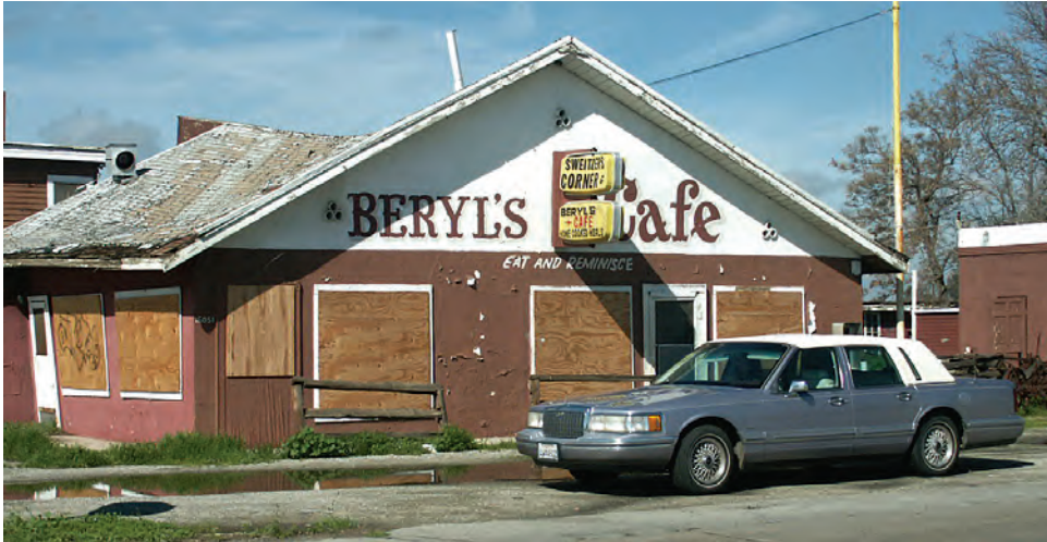
Tim's Town Car south of Bakersfield on a previous trip.

Western Region Lincoln and Continental Owners Club Publication Volume 40 No 1, January, 2011