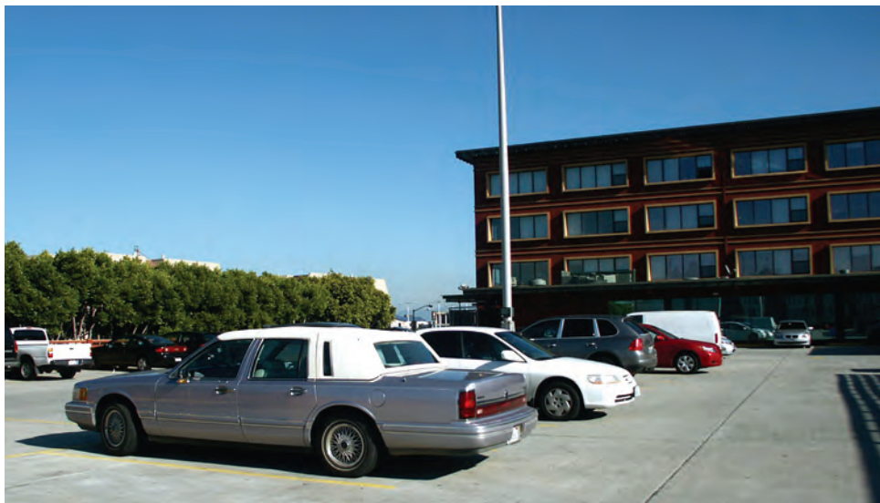
Tim’s Town Car parked at the Northpoint building on Fisherman’s Wharf. That’s the former offices of Gross, Pera, and Rockey in the background.

LaVonne and I made the trip in our 1994 Lincoln Town Car which averaged 22.4 mpg, used not a drop of oil, and turned 120,000 miles on that 1,000 mile round trip. We left Escondido mid-afternoon on a Tuesday, stayed one night in Buttonwillow, and spent Wednesday in the old home town of San Rafael where I once had a collection of 16 old cars in little old garages all over town. It was San Rafael where I began writing Somewhere West of Laramie for Old Cars Weekly and told of my many old car adventures in the San Francisco Bay area. I only have one of those cars left, a 1956 Lincoln Premiere sedan which I originally bought in Berkeley in 1972. Long gone are the 1947 Lincoln Continental Cabriolet, 1938 Lincoln-Zephyr Convertible Sedan, 1947 Ford Woody, 1947 Cadillac Convertible, 1961 and 1962 Lincoln Continental Convertibles, 1955 Lincoln Convertible, and 1956 Lincoln Convertible.