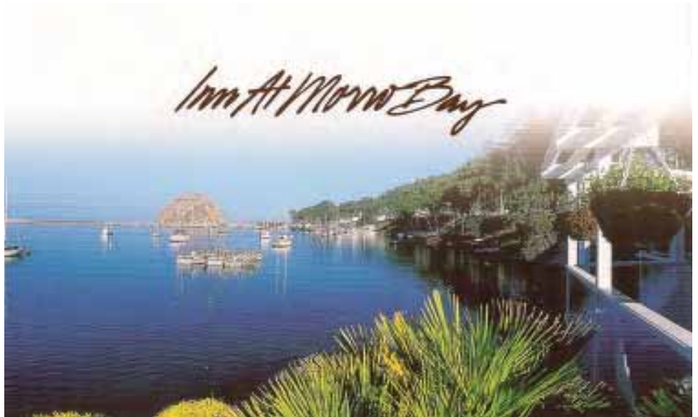
The view from The Inn at Morro Bay.

Take Highway 1 (you can leave 101 in Atascadero and take Highway 41 west to Morro Bay). Take either Main Street south or Morro Bay Blvd. west to Main Street and turn right on Main to The Inn.