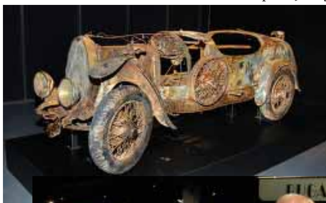
1925 Bugatti after 75 years at the bottom of a Swiss Lake.