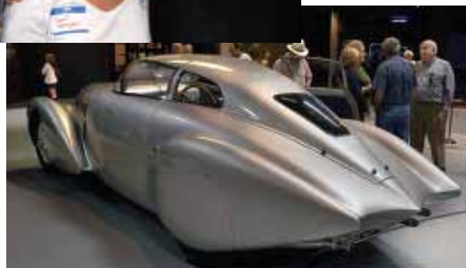
1938 Hispano Suiza Du Bonnet Xenia

Lincoln and Continental owners made it all the more special.