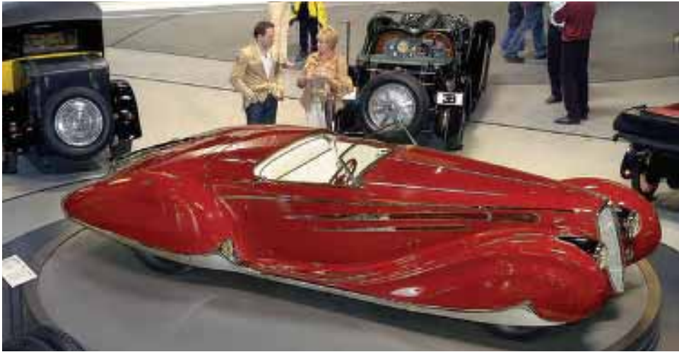
1939 Delahaye Type 163 Cabriolet built for the 1939 New York World's Fair.