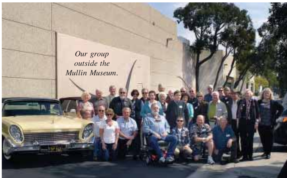
Our group outside the Mullin Museum.