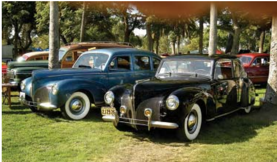
Lincolns at a previous Early Ford V-8 Picnic.

Sunday morning, before the show, we will meet at the new Ruby's Diner at 1128 W. Lincoln Ave. for breakfast between 7:00-7:30am. Click on this link for the menu and driving directions, and enter Anaheim Ca. in the location box: http://www.rubys.com/2-locations/locations.aspx . We will caravan from Ruby's to the park, about