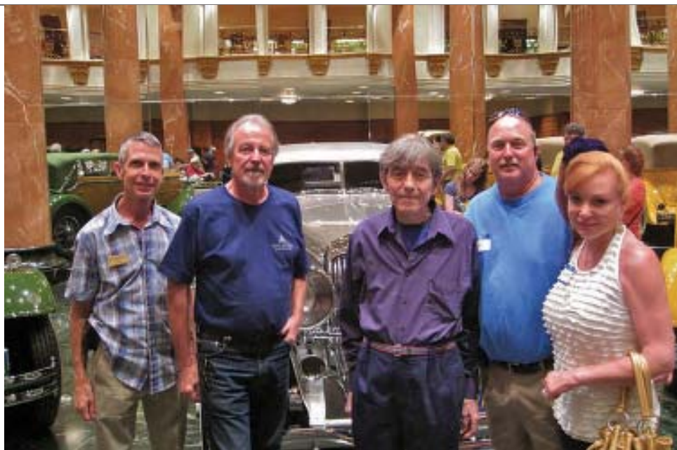
Some of our gang in the Main Salon of the Nethercutt collection.

More information about the Nethercutt Collection can be obtained by going to: http://nethercuttcollection.org/