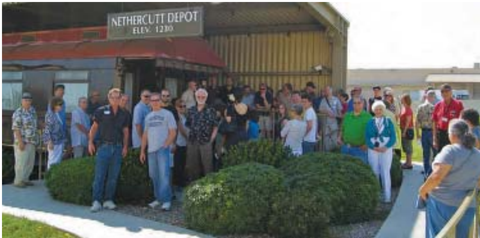
Above, a gathering of Western Region members at the Pullman car. Below right, the main salon of the Nethercutt Collection.