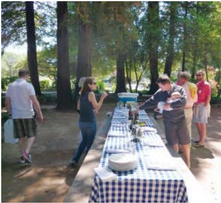
Simi Winery