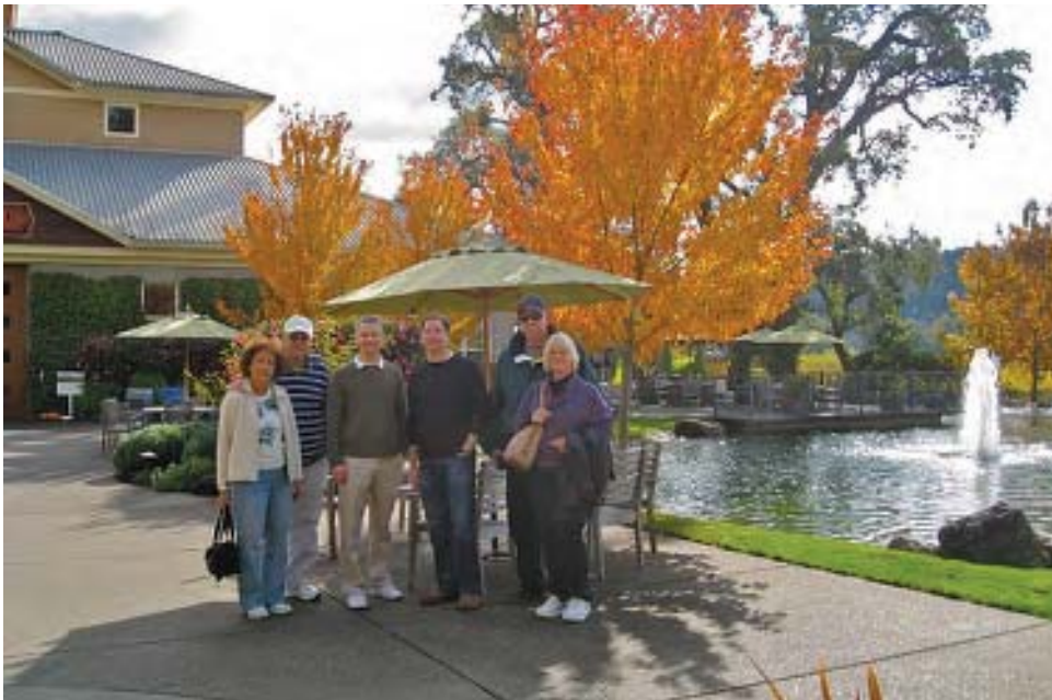
Some of the Board Managers at the Flamingo Hotel in Santa Rosa. The next Board Meeting will be at the Sportsmen's Lodge.