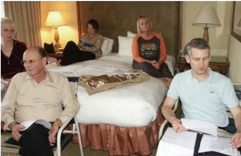
Some of the Board Managers at the Sportsmen's Lodge Winter Board Meeting.