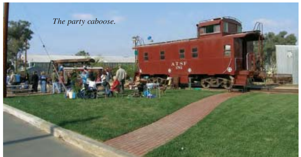
The party caboose.