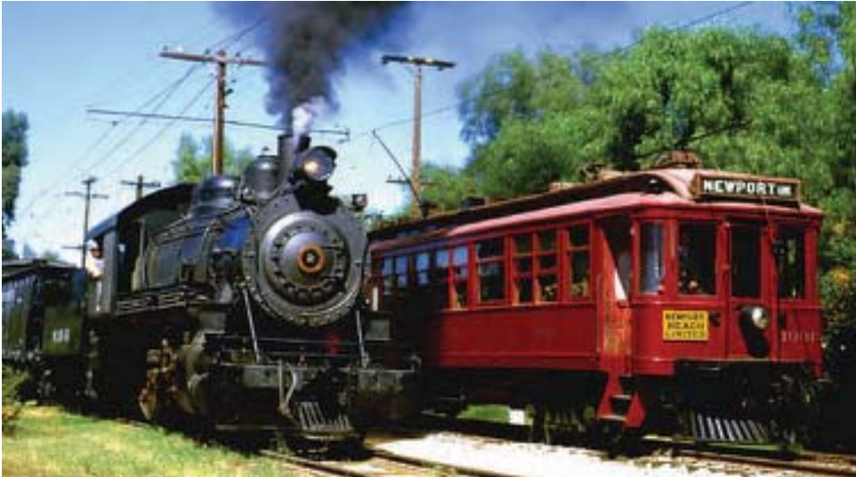
Vintage steam locomotive and Pacific Electric interurban Red Line car at the Orange Empire Railway Museum.