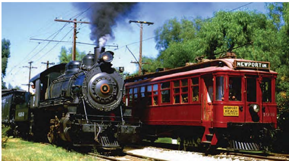
Vintage steam locomotive and Pacific Electric interurban Red Line car at the Orange Empire Railway Museum.