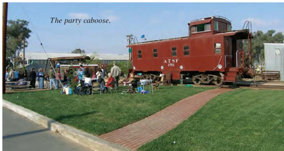
The party caboose.