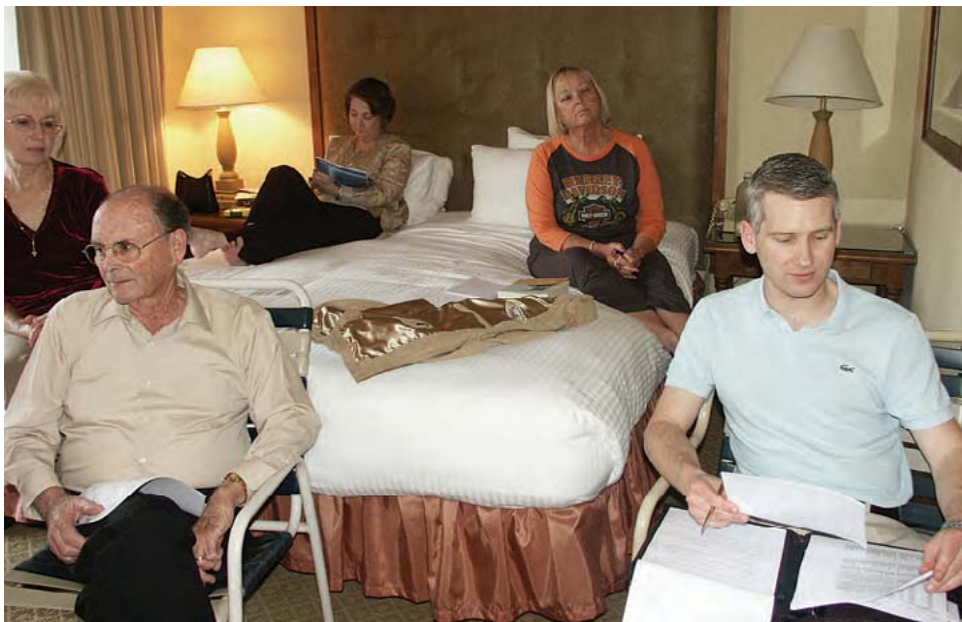
Some of the Board Managers at the Sportsmen's Lodge Winter Board Meeting.