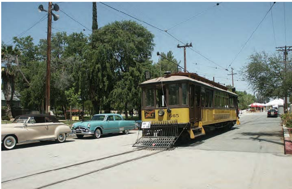
Los Angeles Trolley and Great Autos of Yesterday cars.