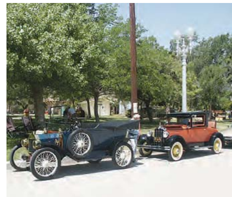
Above, Model T Ford and 1929 Durant from Great Autos of Yesterday.