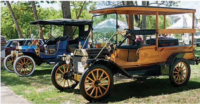
Photos from previous Huntington Beach Concours.