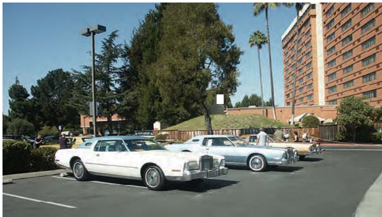
Left, three of the five honored Mark IVs.

On Thursday, we enjoyed a 30 mile driving tour to the fabulous Blackhawk Museum which holds a breathtaking collection of some of the world's most (Continued on Pages 4-5)