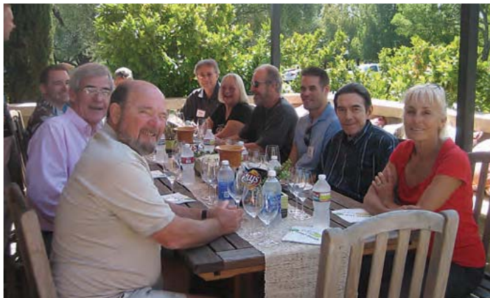
Below right, at the Blackhawk Museum.