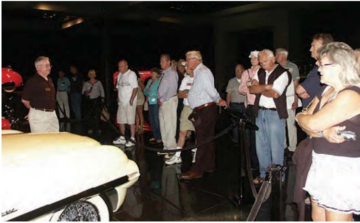
Members inside the Blackhawk Museum.