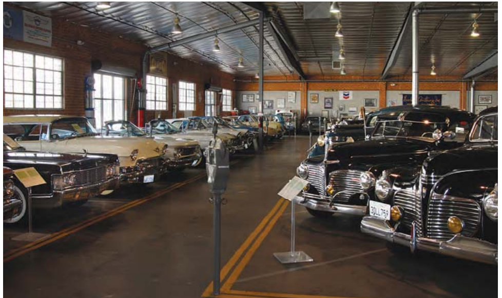
Inside the Automobile Driving Museum.