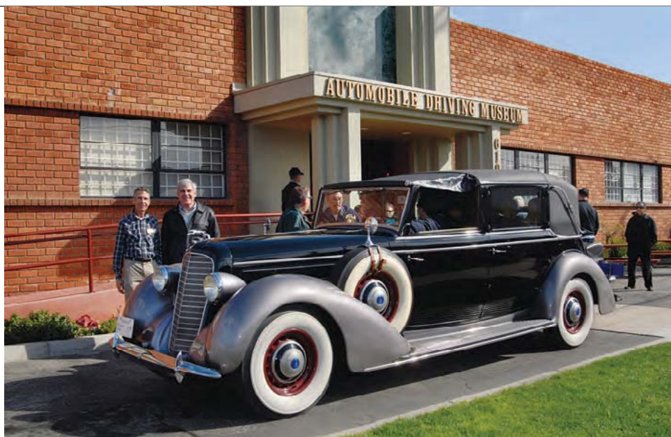
Some of our group with the Automobile Driving Museum's 1936 Lincoln K Towncar.