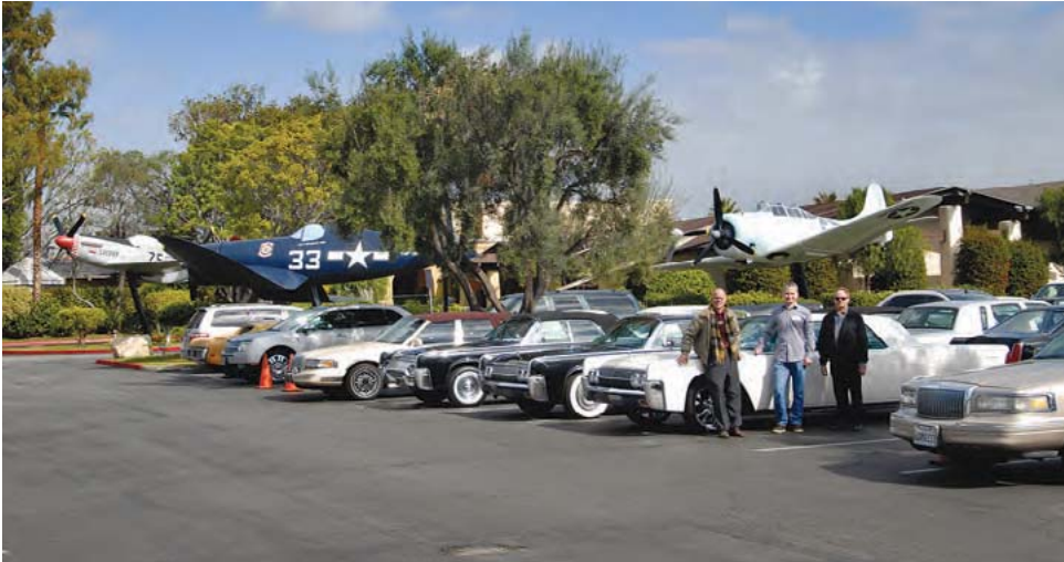
Western Region members and cars at the Proud Bird.