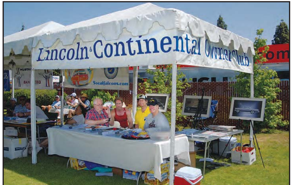
Western Region tent at Fabulous Fords Forever, 2013.