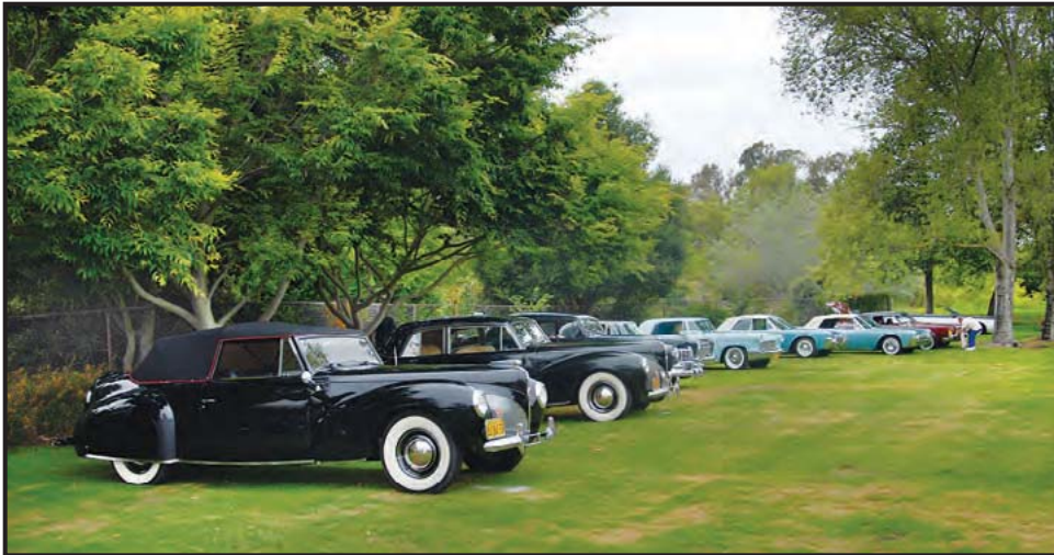
Western Region cars at Huntington Beach, 2012.