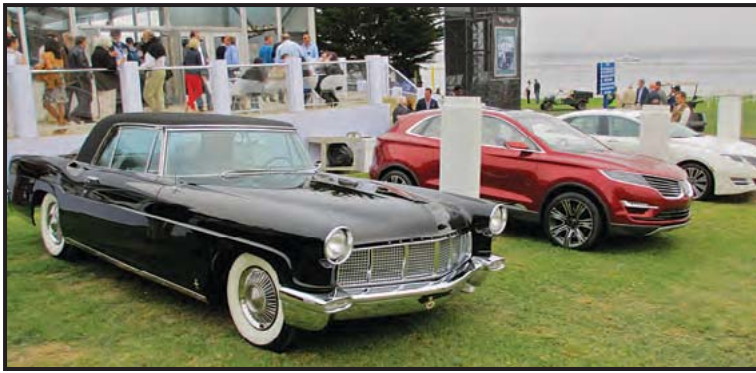
MORE PEBBLE BEACH: Display on the hospitality patio.