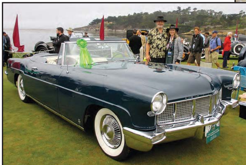
Above, Continental Mark II Convertible. Below, Boano Lincoln 1955 show car.