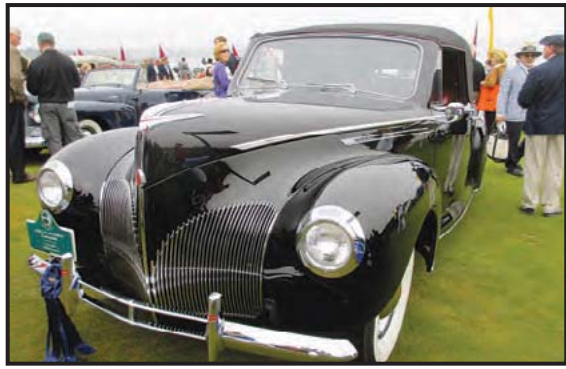
1940 Lincoln Continental Cabriolet.