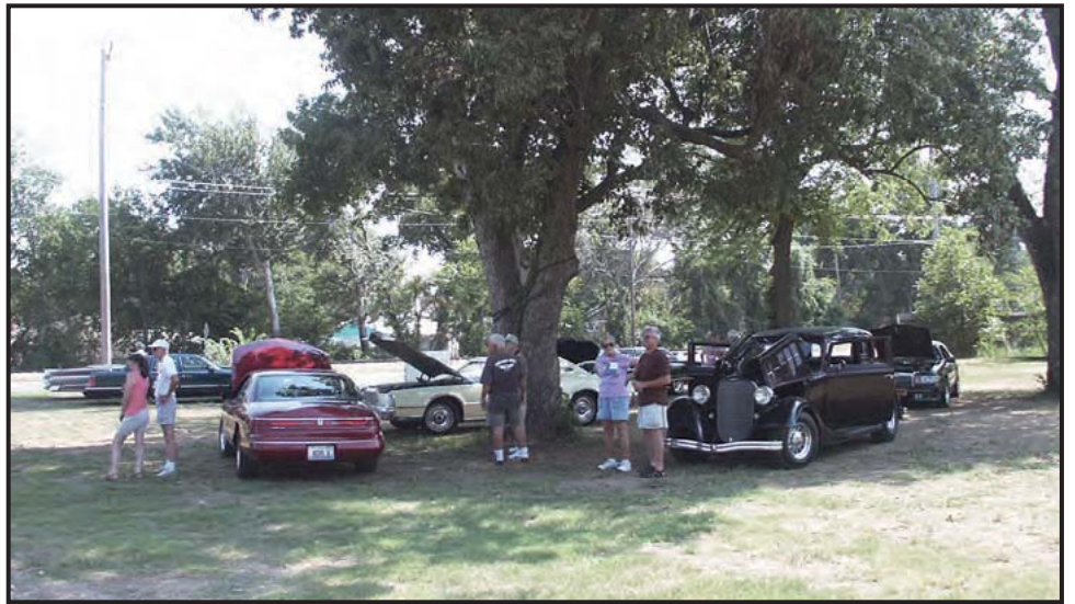
Photo shoot on Route 66.