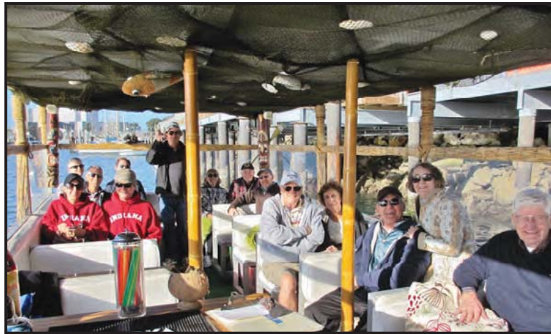
Late afternoon cruise on Morro Bay