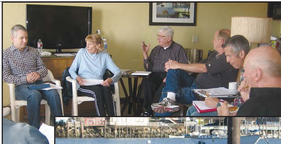
Above, Morro Bay Board Meeting. Right, another Morro Bay board meeting.