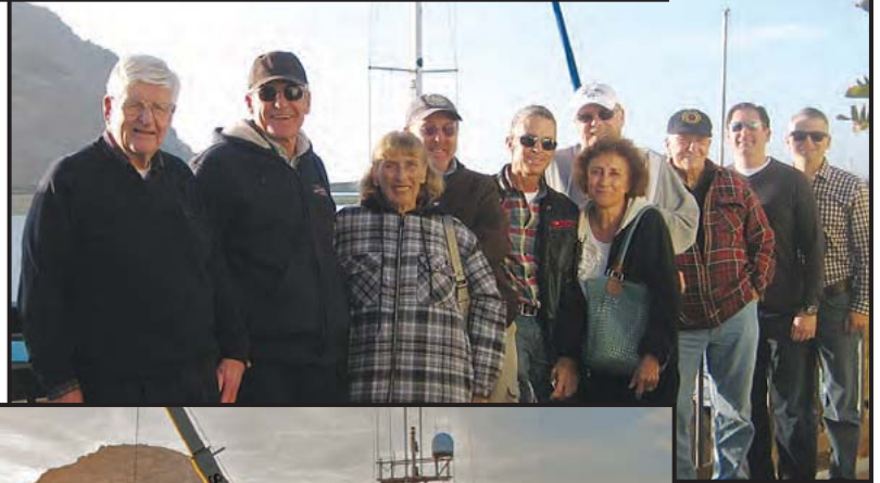
The Board and guests at the Inn at Morro Bay.