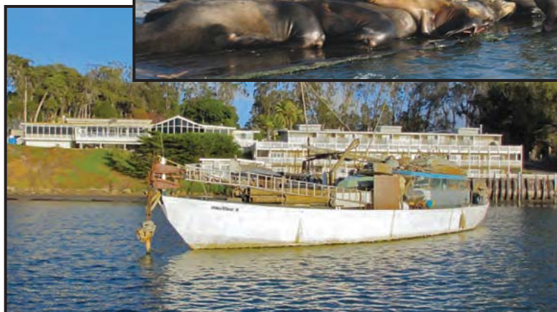
Junk yard boat in front of the Inn at Morro Bay.