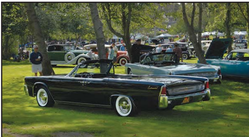
Below, 1961 Lincoln Continental Convertible, Kip Cyprus.

After wandering among the variety of cars, I managed to take a few more pictures for my inventory of cars at "my secret" car spot, under some old pepper trees.