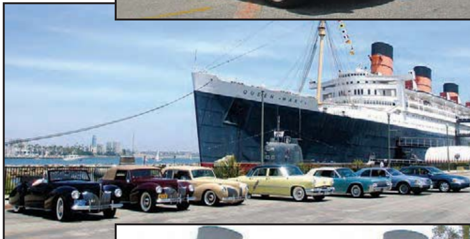
Above, seven of the 14 cars at the Queen Mary.