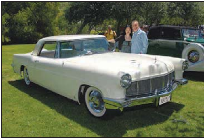
(Huntington Beach Concours continued from Page 1)