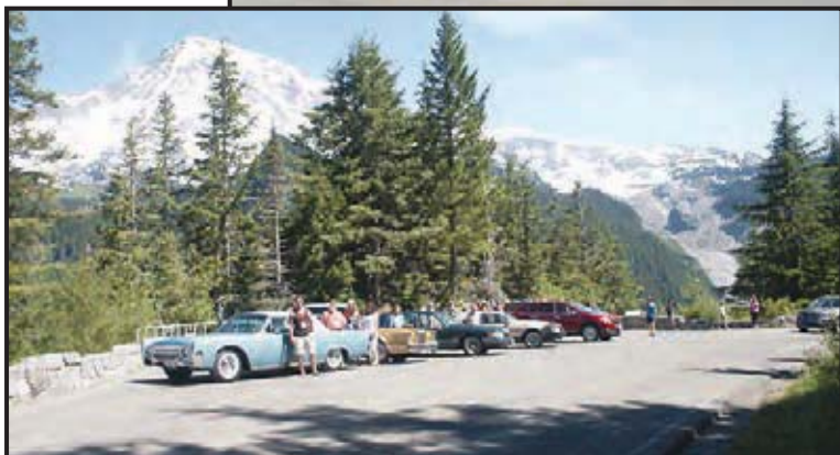
Pausing for photos on the way up Mt. Rainier.