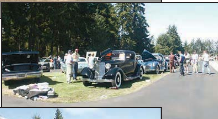
Some of the early cars.