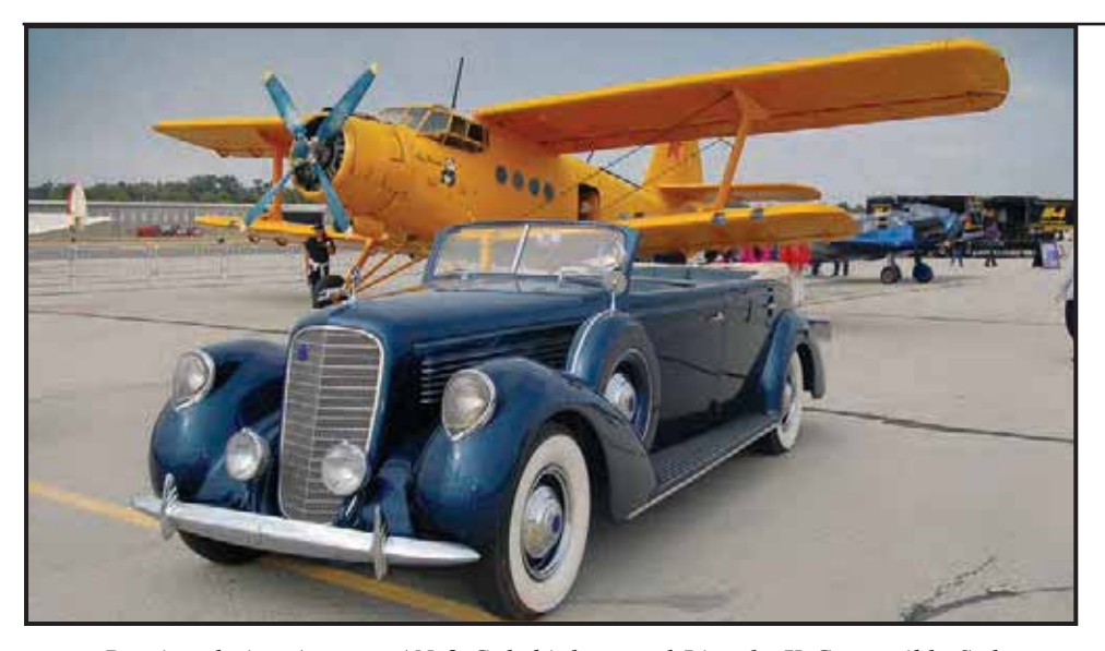
Russian design Antonov AN-2 Colt biplane and Lincoln K Convertible Sedan.