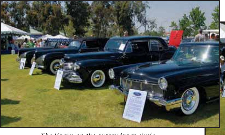
The lineup on the grassy inner circle.