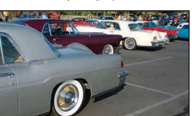
Three Continental Mark IIs.