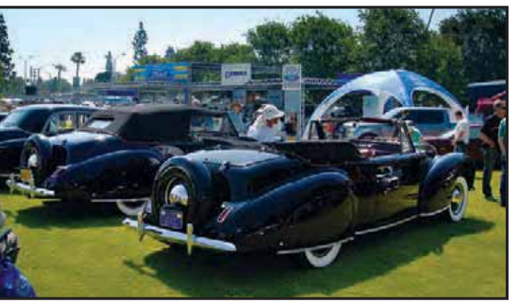
Two 1940 Lincoln Continentals. Below, Continental Mark IV Custom.