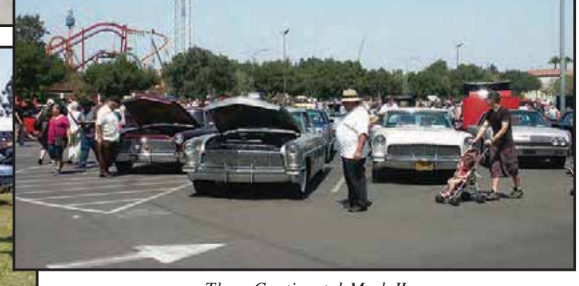
Three Continental Mark IIs.