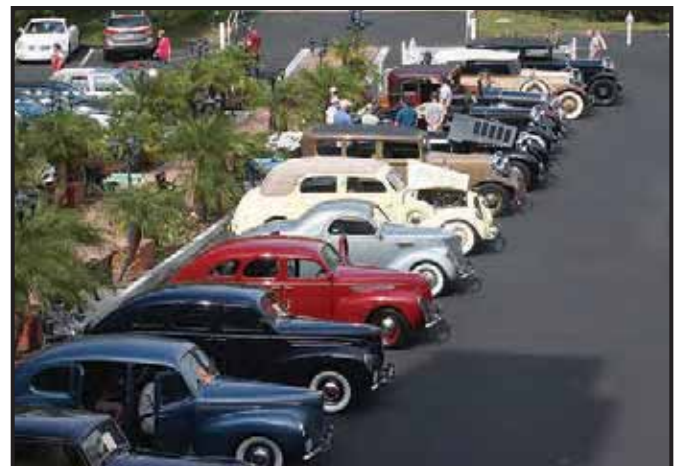
Right, Lincoln Zephyrs and Lincoln Ks and Ls.