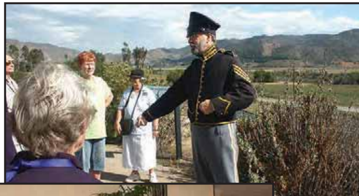
Learning California history at the San Pasqual Battlefield Museum.