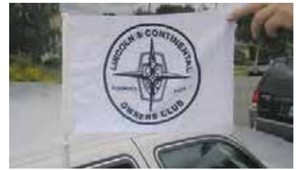
Ride High with LCOC Flags on Your Lincoln

Now available, durable, satin car flag with LCOC logo screen printed on both sides. Easily attaches to Lincolns with frameless side glass (1970 and newer). $30.00 for a set of two. All prices include shipping. Make checks payable to Western Region LCOC and mail to: Baron Night, P.O. Box 5141, Anaheim, CA 92814 For questions about merchandise, e-mail Baron Night at nitrovb@netzero.net.