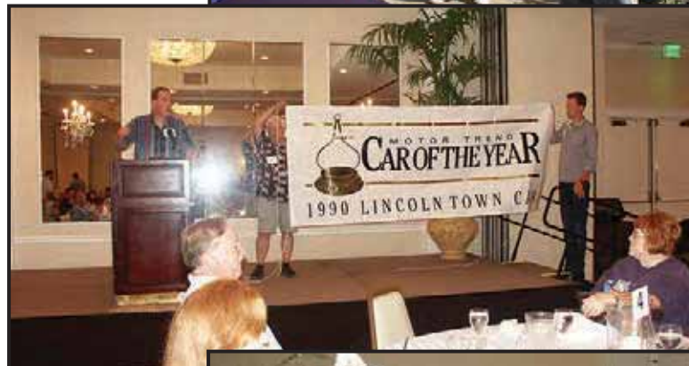
Friday night auction.