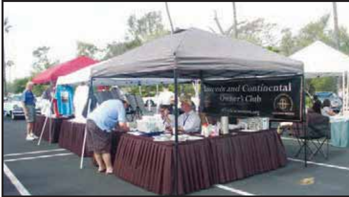
Merchandise booths and LCOC recruitment.