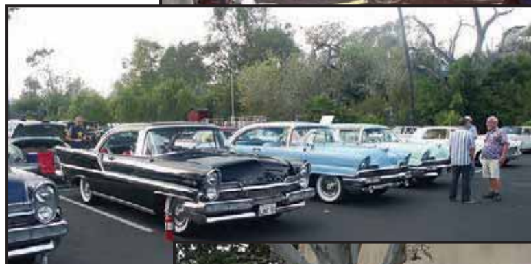
Some of the Fifties cars on the field.