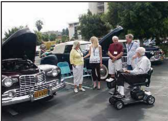
Left, Western Region Members with Forties Cars.

The field from the Fifth floor of the hotel.