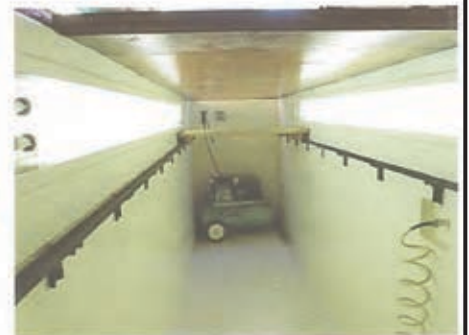
Service Pit & Compressor