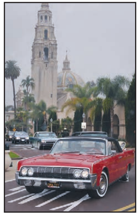
The Witt family's 1964 Linoln Continental Convertible Sedan.