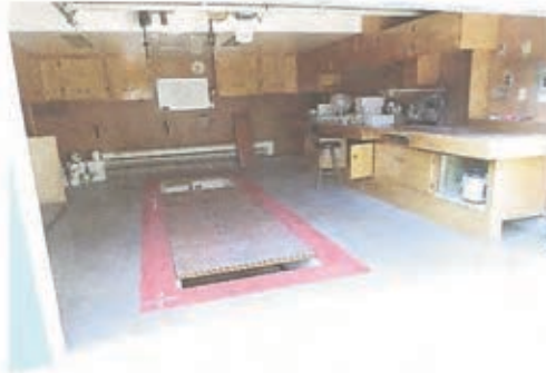
Garage with Service Pit