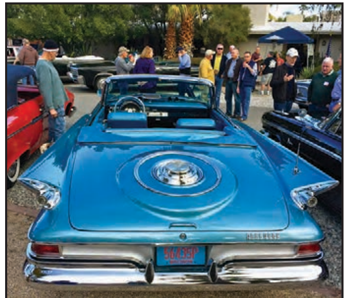
A Classic Sixties Imperial Convertible with the spare tire on the trunk and fins.

The Continental Confab is published and mailed every six weeks. Dates are published annually. The deadline for submitting articles and ads is 20 days prior to the planned mailing date. All articles and ads should be submitted in writing to: 1780 Iris Way, Escondido, CA or e-mail t.howley@cox.net .