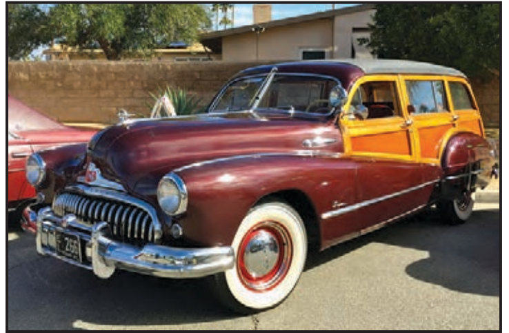
1947 Buick Super Estate Wagon.