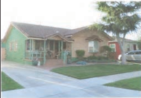
3685 Lees Avenue, Long Beach