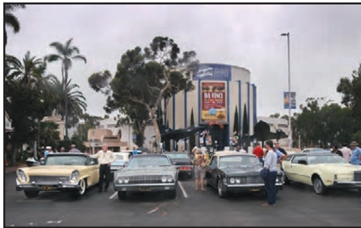
Cars Friday in front of the San Diego Air and Space and Automobile Museums.

One of the most exciting days in Balboa Park was Sunday when Lincoln's new Concept Car made an appearance outside the San Diego Auto Museum surrounded by LCOC members and their cars. Members took some great pictures and had a chance to compare past and present Continentals.