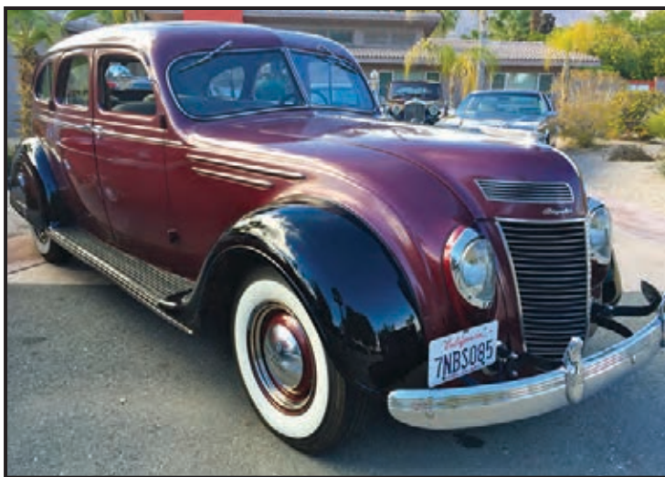
1937 Chrysler Airflow.