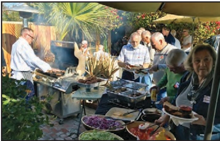
The barbecue line ran all day long.