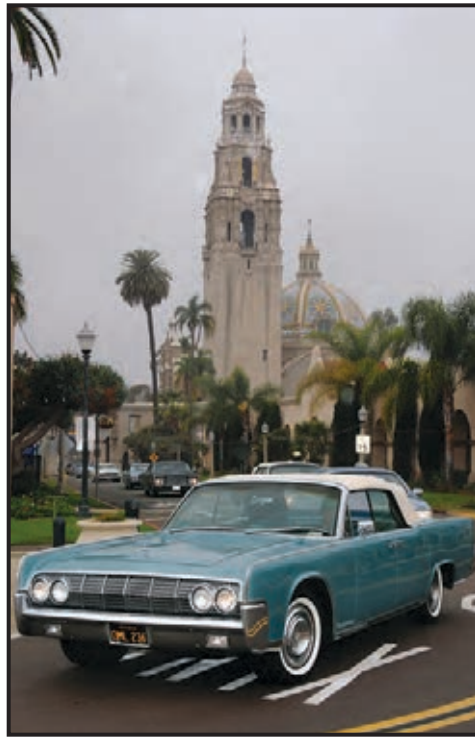
Jim Ayres' 1964 Lincoln Continental Convertible Sedan.