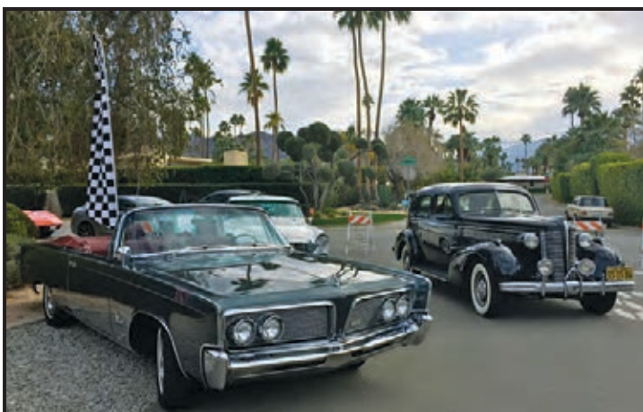
Sixties Imperial Convertible, and a 1938 Buick sedan.