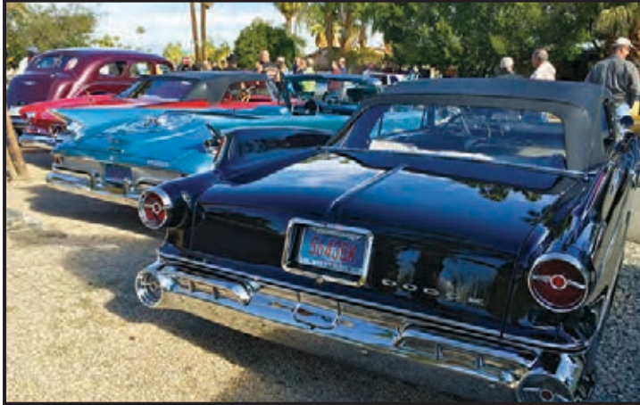
Sixties Dodge with an Imperial, another Dodge and a Chrysler Airflow.