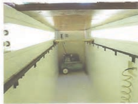
Service Pit & Compressor