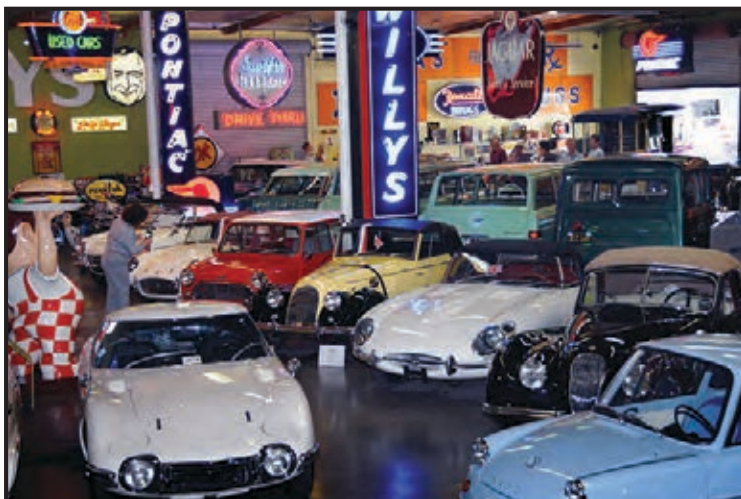
Neon signs are everywhere. Here they shine down on mini and micro import cars.