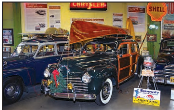
1941 Chrysler Town and Country.