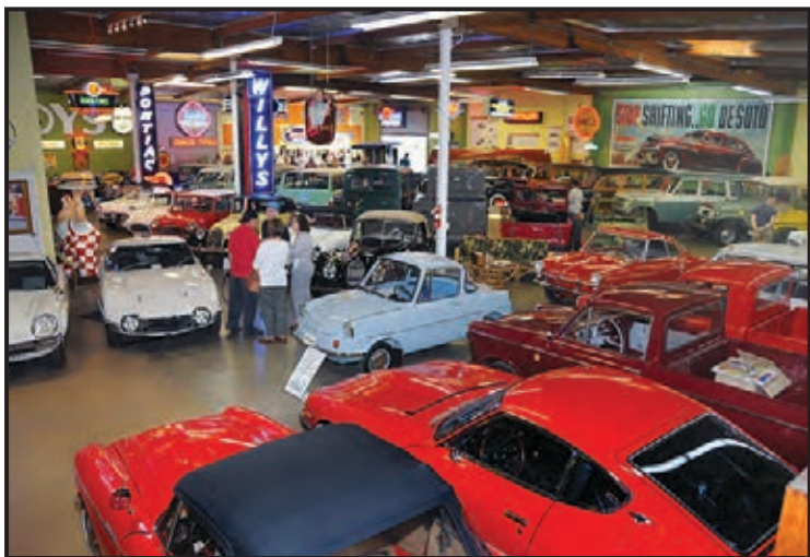
Just some of the unusual cars in the Malamut Museum.