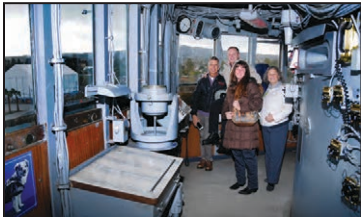
On the bridge of the USS Iowa.

Rare sunroof, Maroon with Maroon leather and fabric interior, all in beautiful condition. New correct tires. Many years in LCOC, owned since 1996 and maintained to the highest standards. Runs and drives perfect.