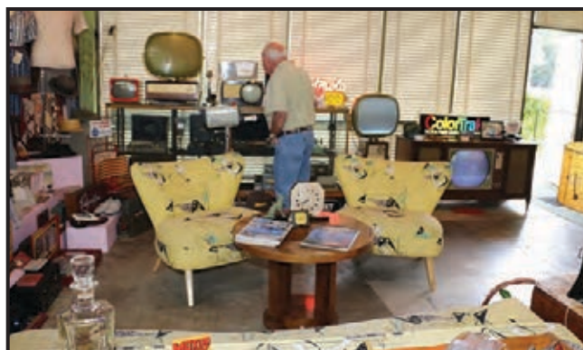
Fifties TV sets abound in the Malamut Museum. Below, left, the Blues Brothers.

Our most recent event of 2016 was a visit to the the Malamut Museum which is north of Los Angeles in Thousand Oaks. The collection is housed in two large warehouse showrooms. It is an eclectic collection of many smaller European micro and mini cars - Messerschmitt, Fiats, Renaults, and Volkswagens, along with some of the classic Mercedes Benz, Porsches, and Jags; with also some rare early '60's Japanese sports cars, and older and newer American cars including woodies.