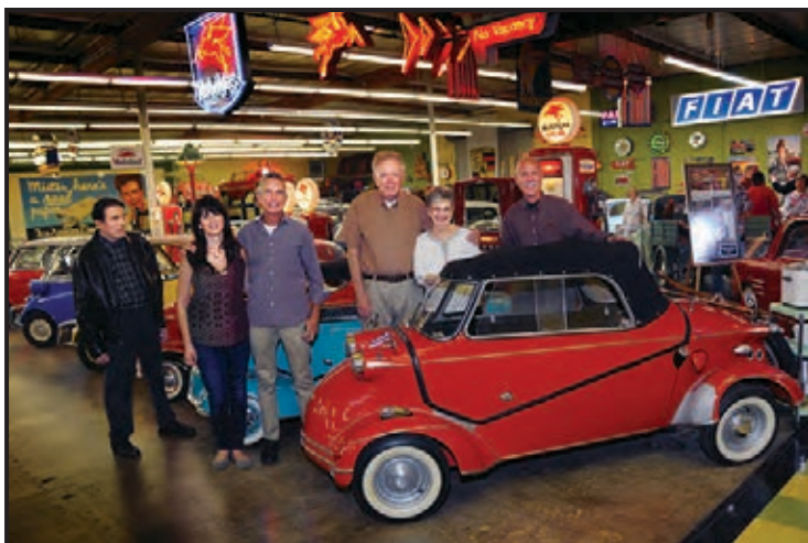
Western Region members among the Isettas.