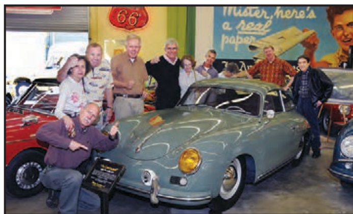
Members with a 1955 Porsche. Below, vintage VW Bus.