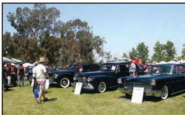
LCOC cars from last year's show.

Register online at info@fabulousfordsforever.com or use the entry form below