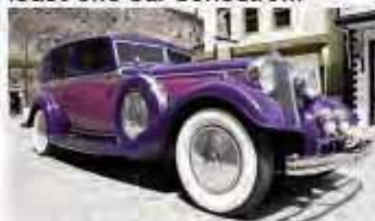
1933 Lincoln Town Car

It wouldn't be an LCOC Meet without checking out at least one car collection.