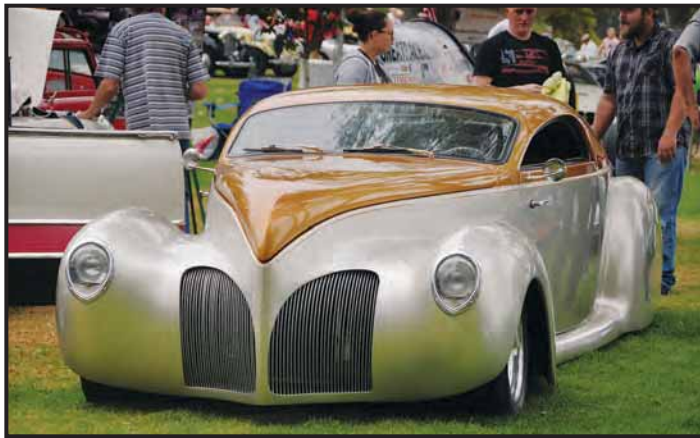
Lincoln- Zephyr Custom Coupe.