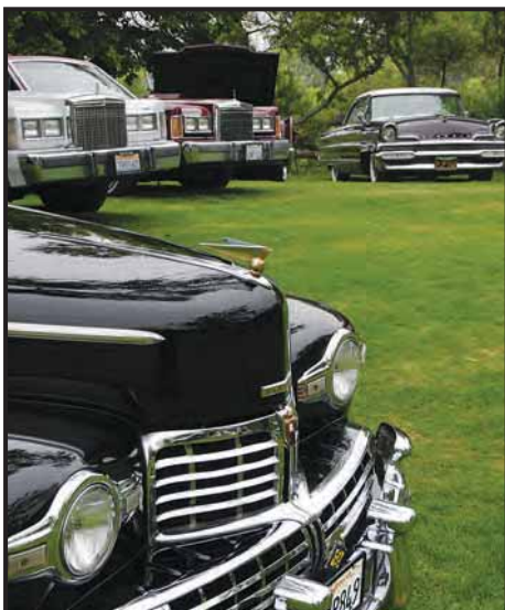
Left, the Lincoln field at Huntington Beach.