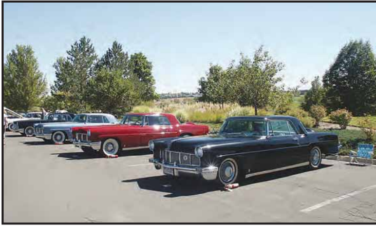
A gathering of Continental Mark IIs.