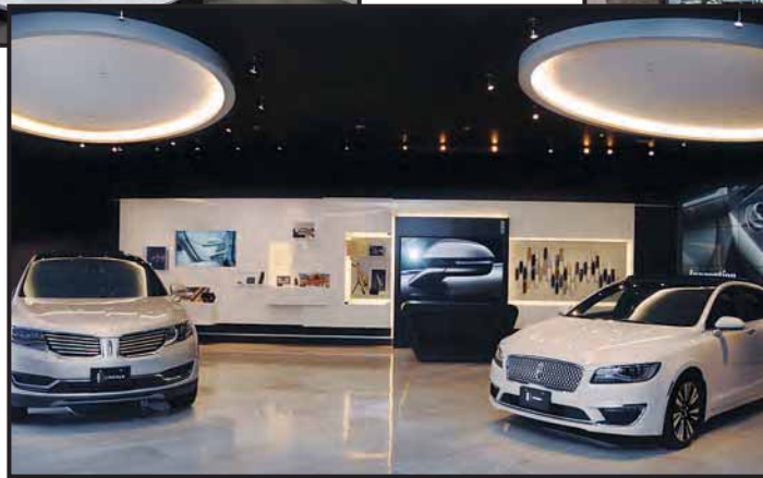
New Lincolns on the show floor.

LEC will soon host periodic events that feature local artists, merchants and other guests and programs of local interest.