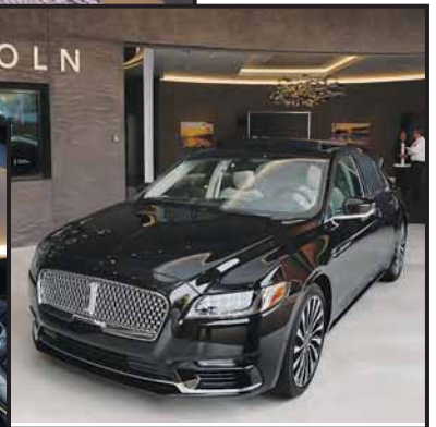
The forthcoming 2017 Lincoln Continental.

More Lincoln Experience Centers are expected to open soon around the country. The Western Region hopes to hold activities at the Fashion Island Experience Center in the near future.