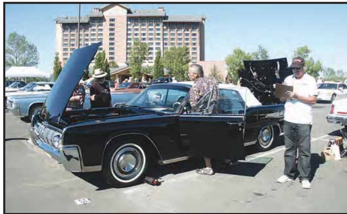
Judging Widener's 1964 LC Convertible from Tacoma, Washington.