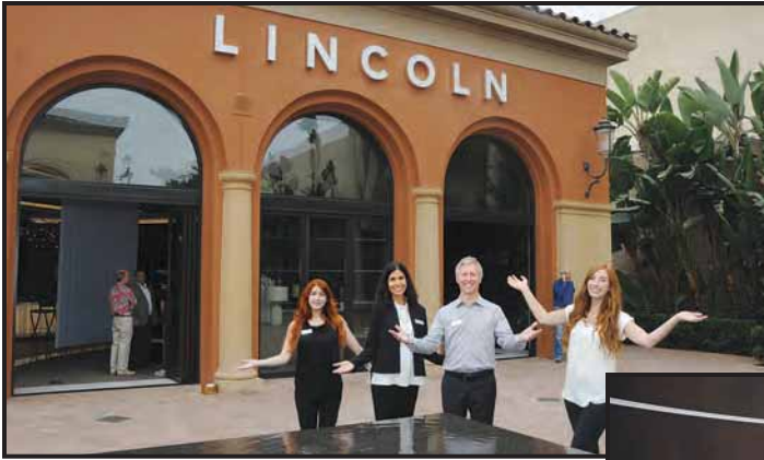
Outside the Lincoln Experience Center