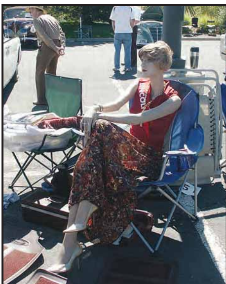
Left, Mannequin at the Denver Meet.