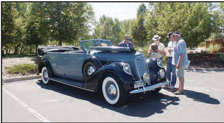
1939 Lincoln K Touring.