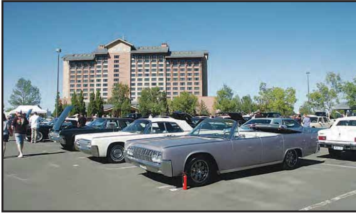
Cars on the field.