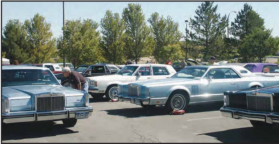
Left, Continental traffic jam at the Denver Meet.