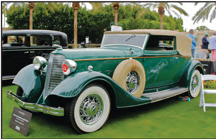
1933 Lincoln Lincoln K Convertible Victoria