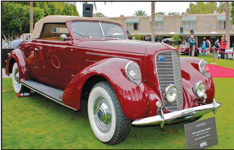
1937 Lincoln K Cabriolet.