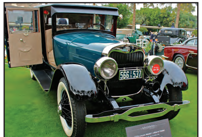
1926 Lincoln L LeBaron Sedan won in the Classic Era Lincoln Class