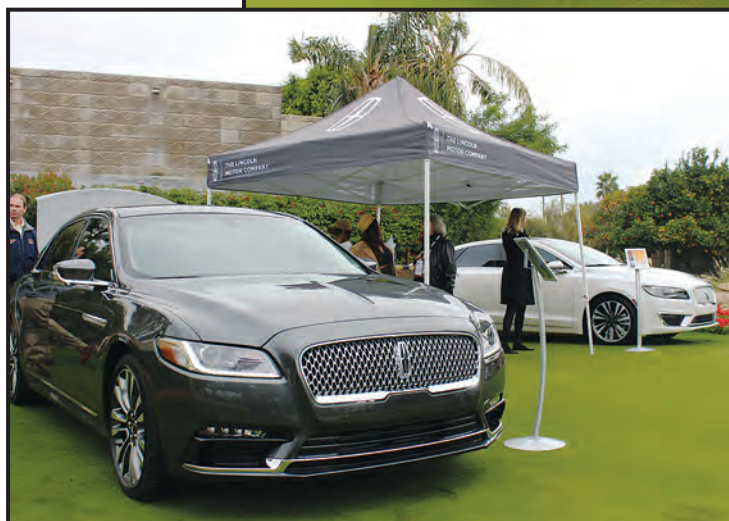
2017 Lincoln Continental.