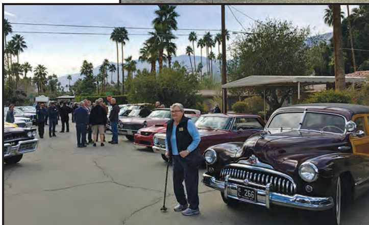
The street was blocked off for this event.