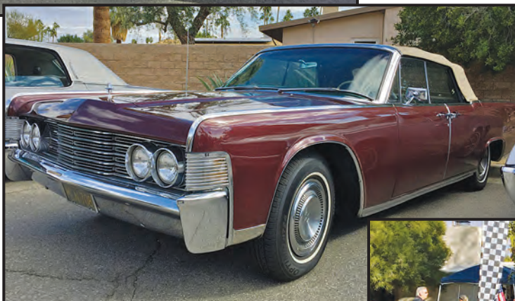
Maroon 1965 Lincoln Continental Convertible

The street was closed around 9:00 a.m. The cost was $15 at the door to cover food and drink. The event was held at 1228 San Lorenzo Rd., Palm Springs, Ca. 92264