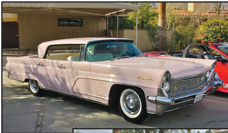
Pink 1959 Lincoln Landau