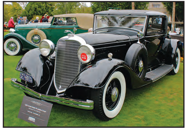
1933 Lincoln K Judkins Coupe.

These are some of the Lincolns at the three-day 2017 Arizona Concours at the Biltmore Resort in Scottsdale, Arizona honoring Lincolns. A beautiful 1926 Lincoln LeBaron sedan won in the Classic Era Lincoln Class while the Historic Vehicle Association's Most Well Preserved Vehicle was a 1933 Lincoln KB Judkins Coupe.