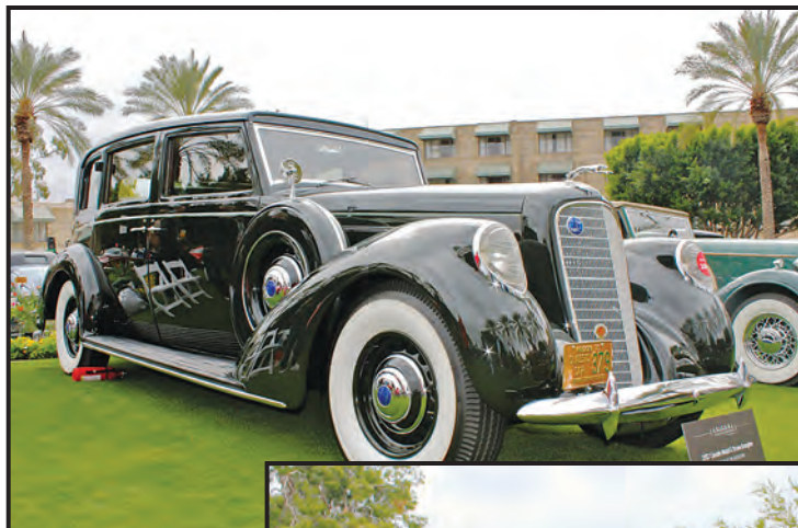
1938 Lincoln K Brunn Brougham.