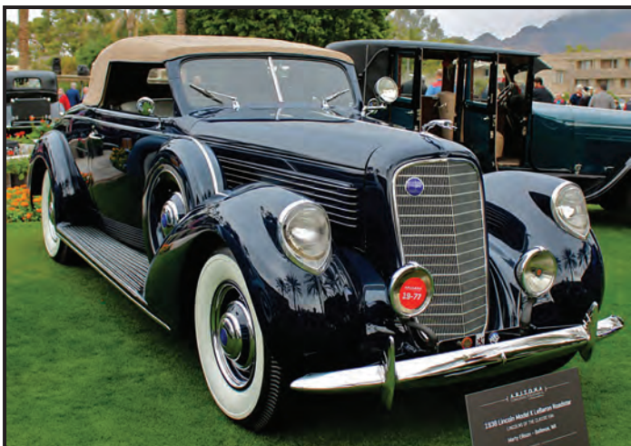
1938 Lincoln K LeBaron Roadster.