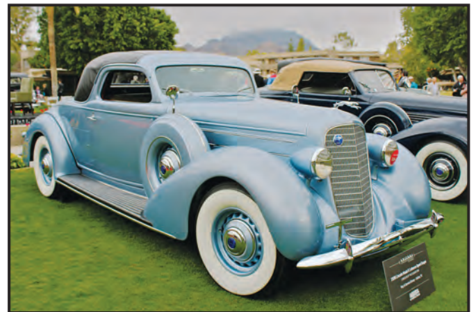
1936 Lincoln K LeBaron Sport Coupe.