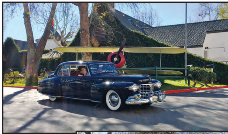
Kickoff Brunch continued from Page 5