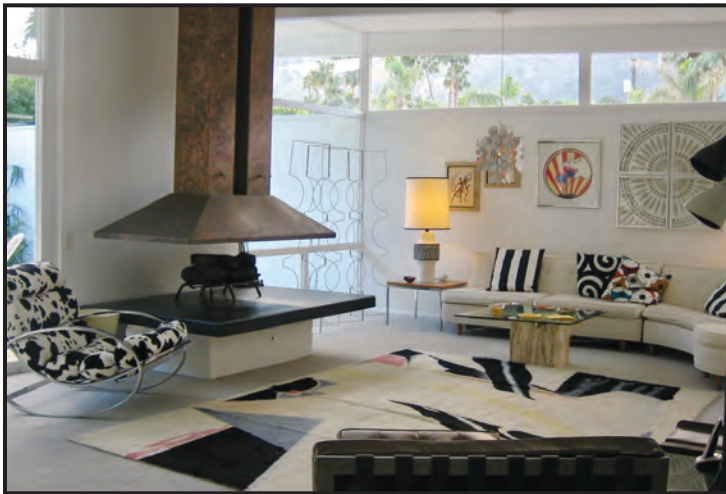
Interior of the Wexler House.