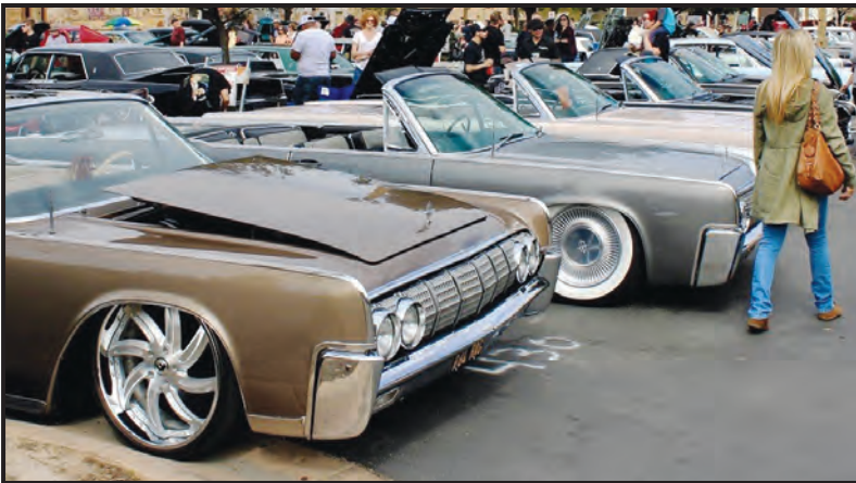
Below, 1961 Lincoln Continental customized sedan.