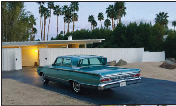
Above, 1964 Mercury Park Lane in front of the Wexler house.