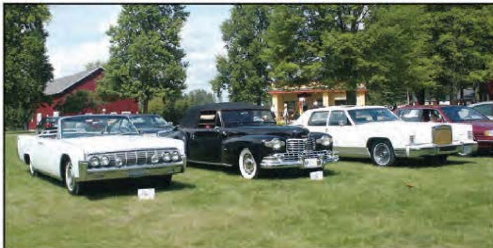
A few of the cars at the LCOC Show at Hickory Corners on Sunday.