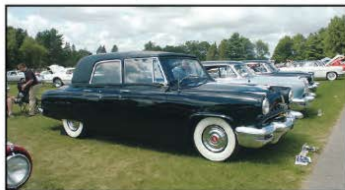
Eleanor Ford's 1952 Lincoln Town Car Limousine.