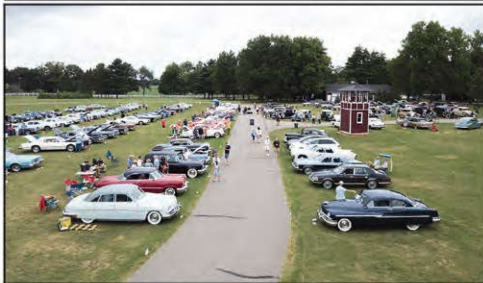
Overview of the field, Mitch Carr drone photo.