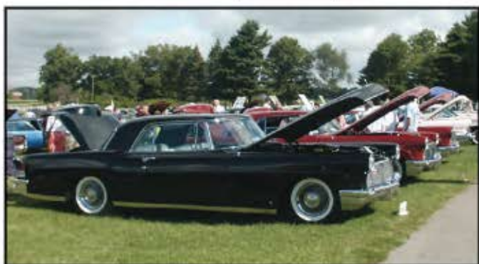
Continental Mark IIs on the show field Saturday.