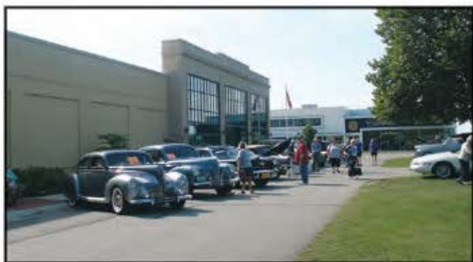
Cars in front of the Lincoln Museum at the LCOC show Sunday.