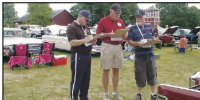
Judging at the Hickory Corners Homecoming.