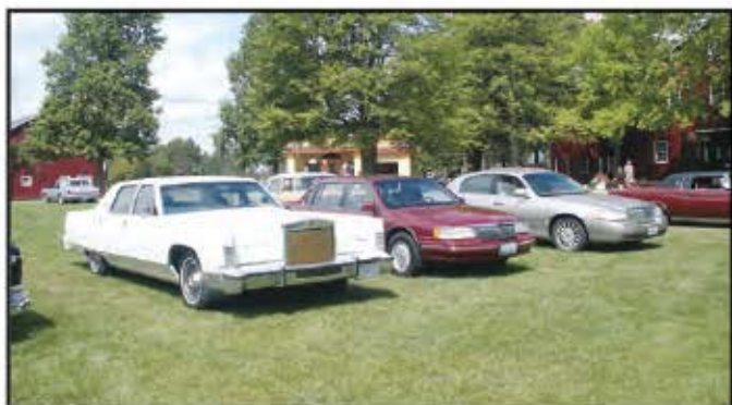
A few of the cars at the LCOC Show at Hickory Corners on Sunday.