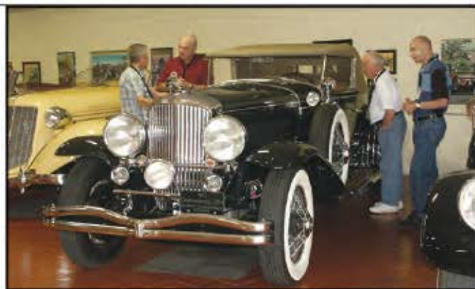
LCOC members inspecting a J Duesenberg at the Parfet Collection.

Get the full story with all the winners in the November-December issue of Lincoln and Continental Comments .