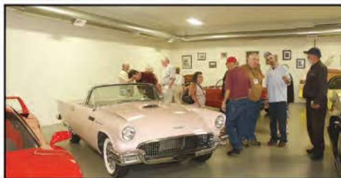
LCOC members with a 1947 Thunderbird at the Parfet Collection.