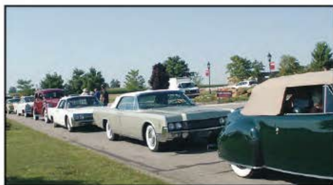
Getting ready to leave the Gilmore Museum on one of the tours.