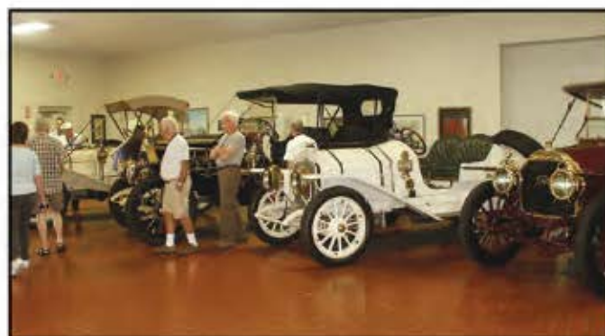
The Parfet Collection includes a number of early Packards.